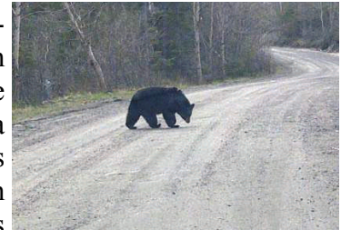
Local Wildlife Make Patrols

Defence. We have one Site Manager, four Shift Supervisors/Dispatchers, one Military Police Orderly Room/Identification Clerk, twelve full time Commissionaires and up to nine casual Commissionaires working at the site. Our duties include Military Police Dispatch operations, two mobile security patrols and one access control point to the airfield. These duties are conducted 24/7. In addition we operate the Military Police Orderly Room, Identification Section and Physical Security Section. On top of our regular contract with SERCO we also provide additional security for a wide variety of activities that are conducted on the base such as escorts for contractors and aircraft security.