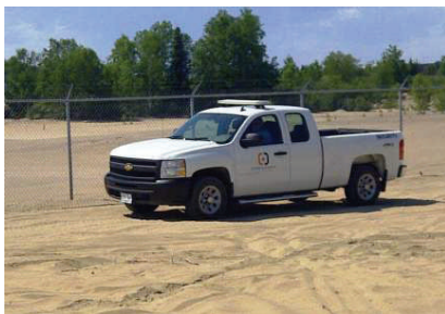
Perimeter Fence Inspection

Commissionaires have been providing continual security services on the base since 1989. Currently we are in the 8 th year of a 10 year contract with SERCO to provide security services as part of their Alternate Services Delivery contract to operate the base for the Department of National