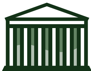
Building A Stronger Division