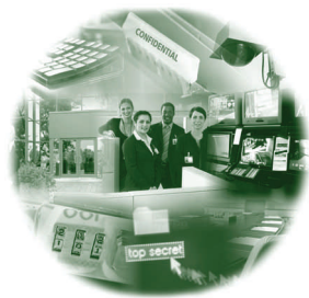
Commissionaires Newfoundland & Labrador

Commissionaires offers cutting-edge digital fingerprinting services for the fastest, most reliable results available. As one of only two providers, Commissionaires has clearance from the RCMP to capture fingerprints and submit them directly to the Canadian Criminal Real Time