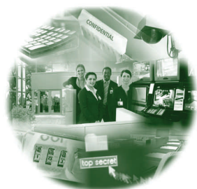
Commissionaires Newfoundland & Labrador

A reminder to all Site Managers that should you or some other staff member in your site, terminate employment with the Canadian Corps of Commissionaires, a TBS/SCT 330-47, - SECURITY SCREENING CERTIFICATE AND BIEEFING FORM has to be completed.